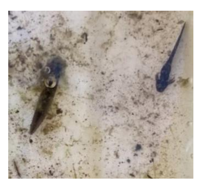
and tadpoles in the spring